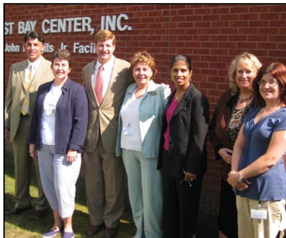
Congressman Kennedy and EBC Leadership Staff